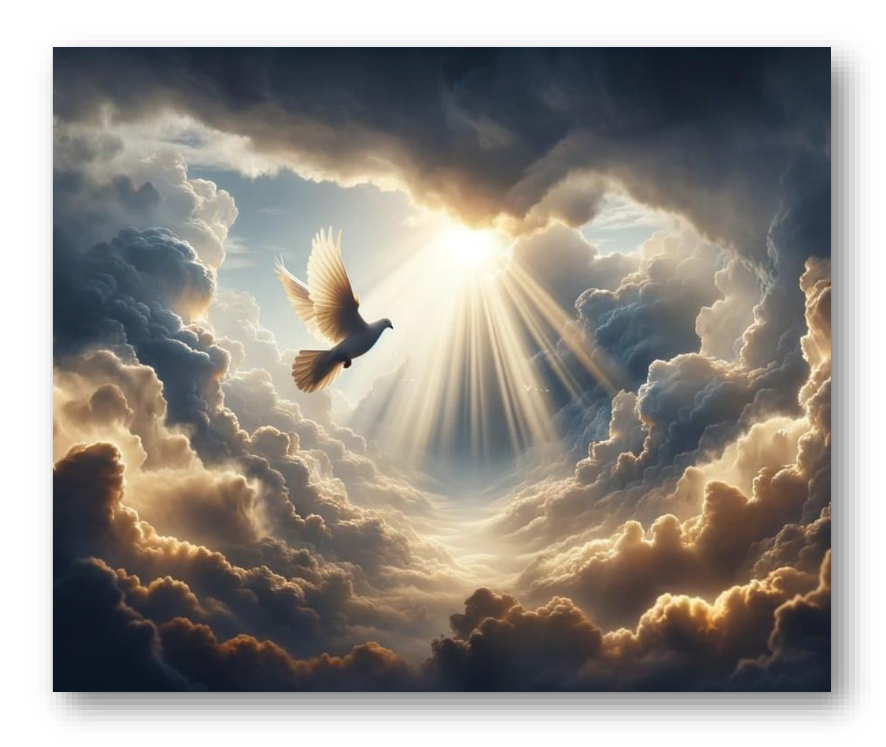
... and kindle in them the fire of your love. Alleluia!