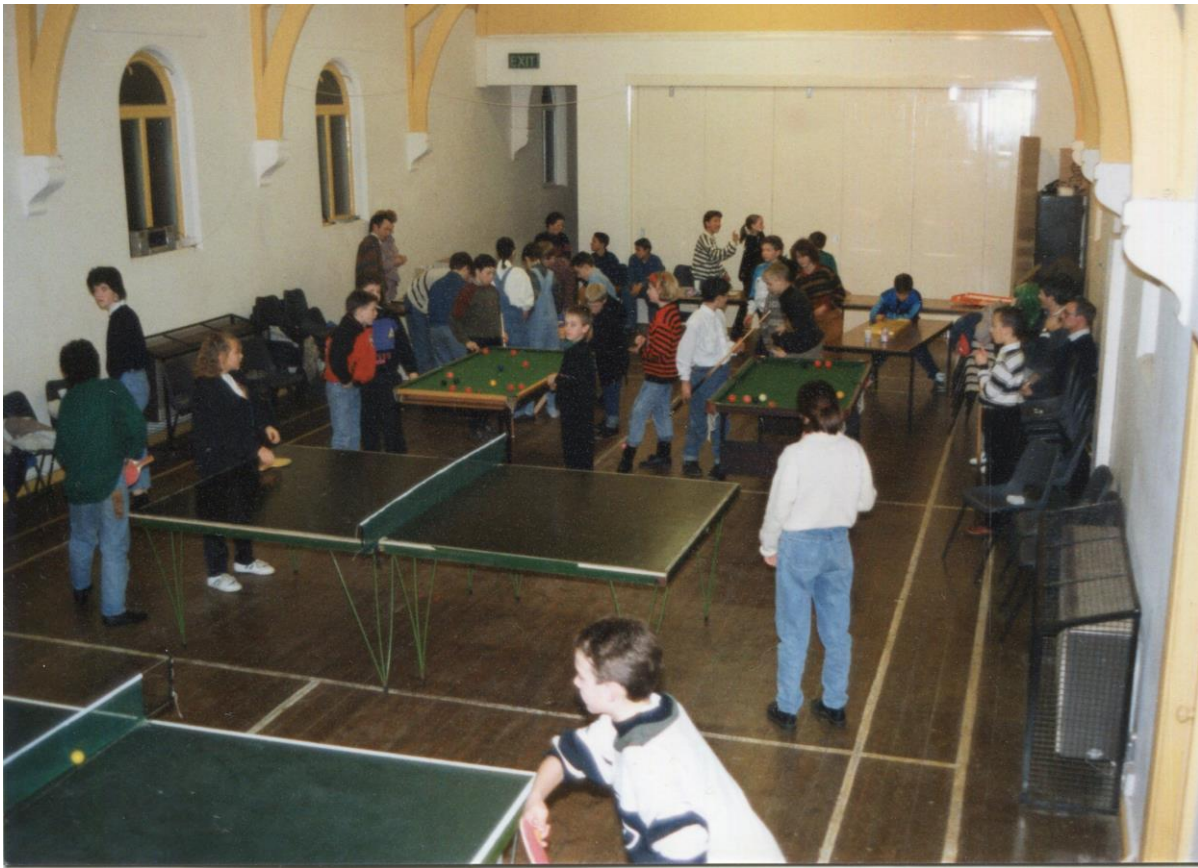
Youth Group at St Edward's in 1990

Our Parish is very blessed with a number of groups and societies. However, most of them are for adults. We are hoping to launch a specific group for our young people on Friday, 5 th January 2024 at 6.30 pm until 8.00 pm . I want this to be a fun time with games, competitions, art work, and there will be always something delicious to eat. The main goal of these meetings would be to learn more about our Faith, to build a strong relationship with God and to make friendships with other young people, which could last a lifetime. Initially, these meetings will be held on the first Friday of the month in the parish hall. They will be open for those who are between 12 - 17 years. If these meetings are successful, we might organise days away. My long-term aim is that as these young people mature, we will be able to set up a group for young adults. I ask all parents to support this initiative and encourage their children to attend our Parish Youth Group.