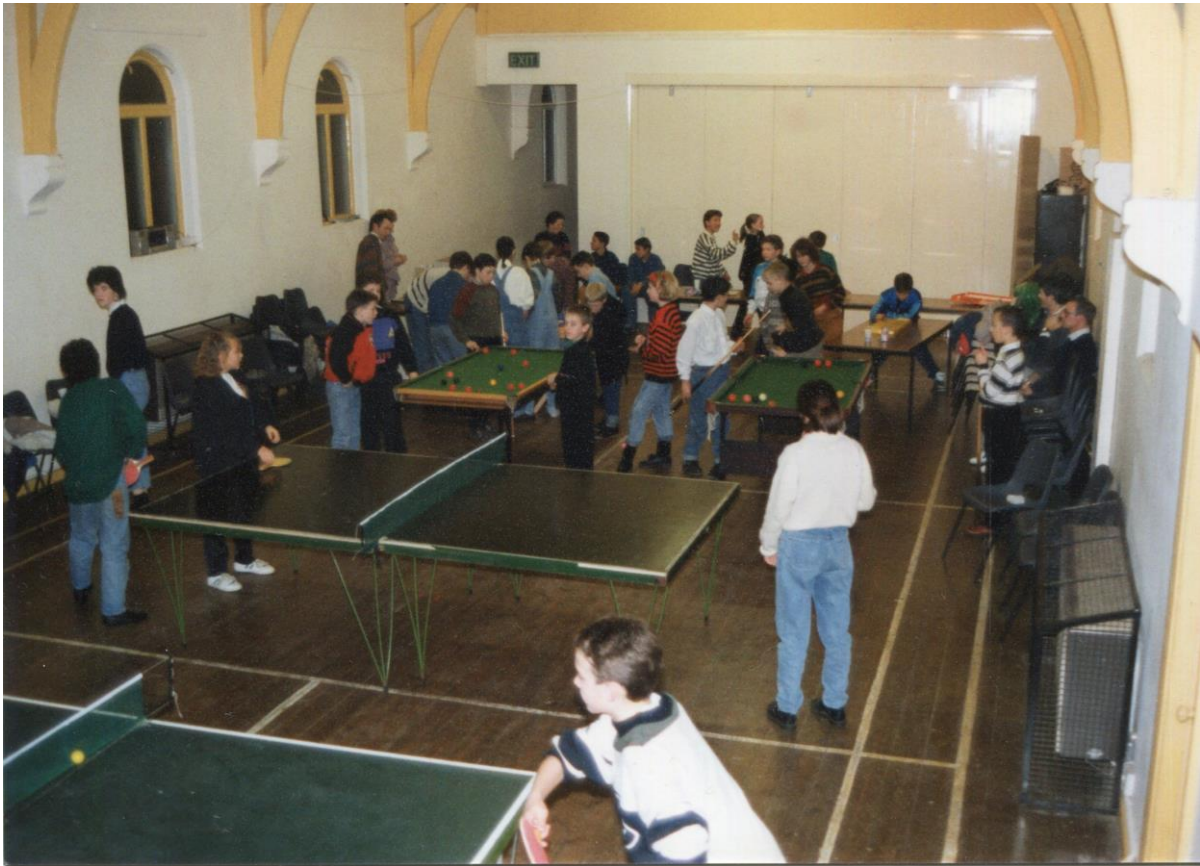
Youth Group at St Edward's in 1990

Our Parish is very blessed with a number of groups and societies. However, most of them are for adults. We are hoping to launch a specific group for our young people on Friday, 5 th January 2024 at 6.30 pm until 8.00 pm . I want this to be a fun time with games, competitions, art work, and there will be always something delicious to eat. The main goal of these meetings would be to learn more about our Faith, to build a strong relationship with God and to make friendships with other young people, which could last a lifetime. Initially, these meetings will be held on the first Friday of the month in the parish hall. They will be open for those who are between 12 - 17 years. If these meetings are successful, we might organise days away. My long-term aim is that as these young people mature, we will be able to set up a group for young adults. I ask all parents to support this initiative and encourage their children to attend our Parish Youth Group.