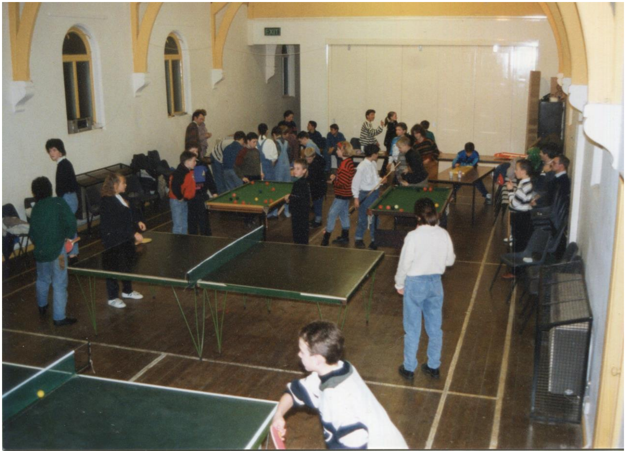
Youth Group at St Edward's in 1990

Our Parish is very blessed with a number of groups and societies. However, most of them are for adults. We are hoping to launch a specific group for our young people on Friday, 5 th January 2024 at 6.30 pm until 8.00 pm . I want this to be a fun time with games, competitions, art work, and there will be always something delicious to eat. The main goal of these meetings would be to learn more about our Faith, to build a strong relationship with God and to make friendships with other young people, which could last a lifetime. Initially, these meetings will be held on the first Friday of the month in the parish hall. They will be open for those who are between 12 - 17 years. If these meetings are successful, we might organise days away. My long-term aim is that as these young people mature, we will be able to set up a group for young adults. I ask all parents to support this initiative and encourage their children to attend our Parish Youth Group.