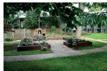
The Healing Garden at Northampton Cathedral

We will be sensitive to those we speak with and not presume to know what they can offer.