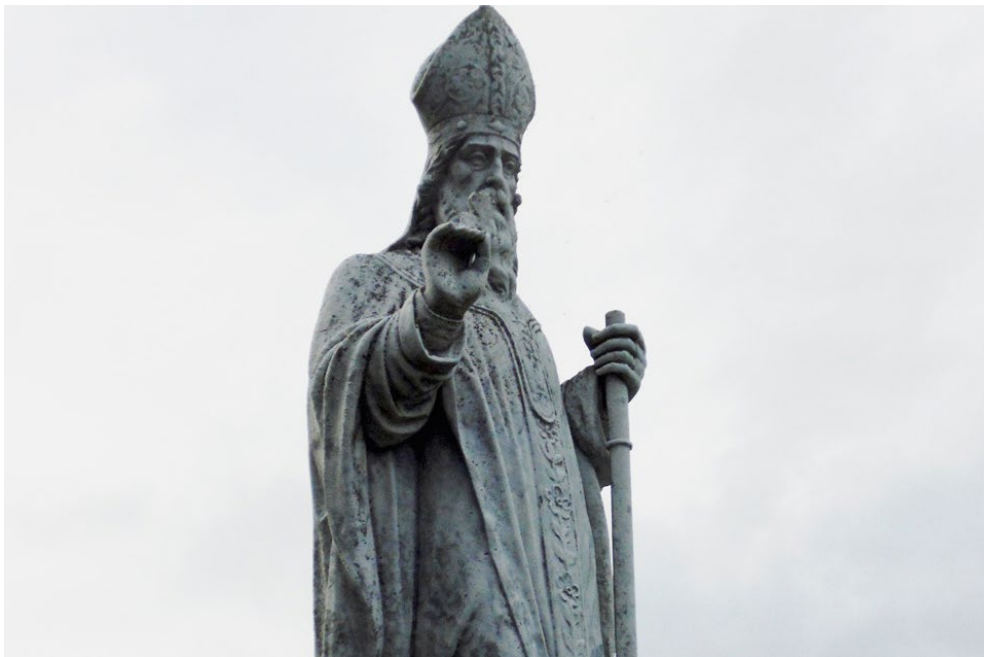
Statue of St. Patrick, Hill of Tara

This week we have the feast days of two extremely popular saints: St. Patrick on March 17 th (Wednesday) and St. Joseph on March 19 th (Friday).