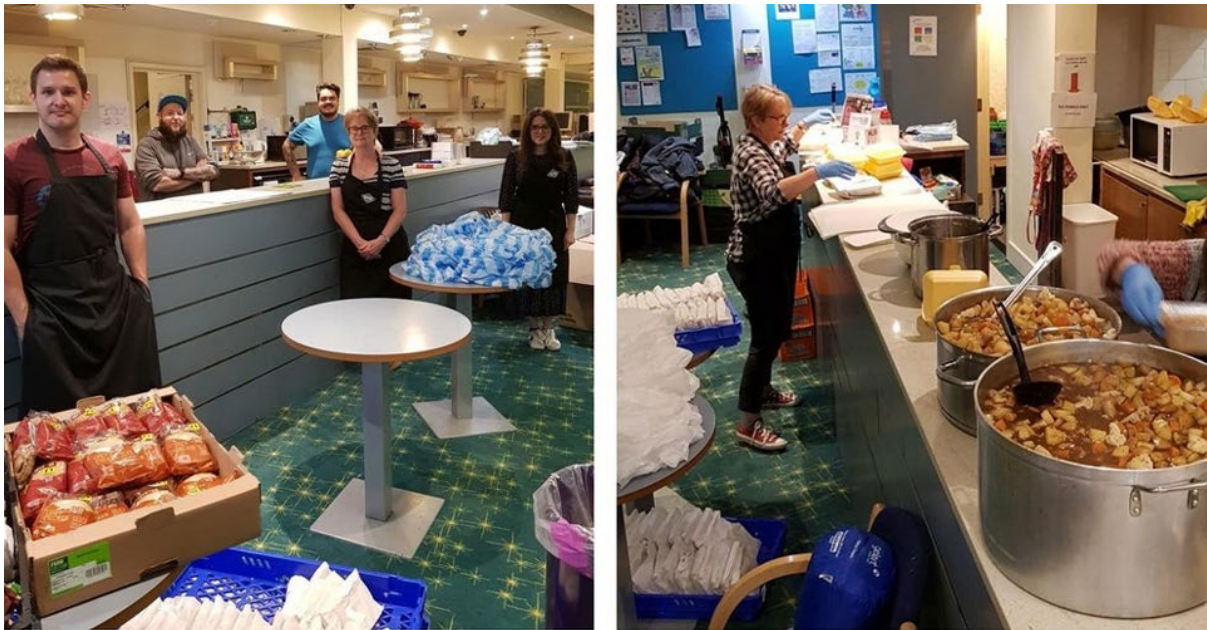
Corona Kitchen at Eden Centre, Kettering.

Since the March Lockdown our own Tuesday afternoon Soup Kitchen has been closed and, it may have to stay closed for some time. The Kettering Food Bank has continued to operate but it has not been as easy as it was for parishioners to make donations via the box at the back of St Edward's. The Food Bank has moved to