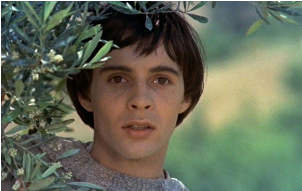
Image from the Film: Brother Sun, Sister Moon about the Life of St. Francis of Assisi